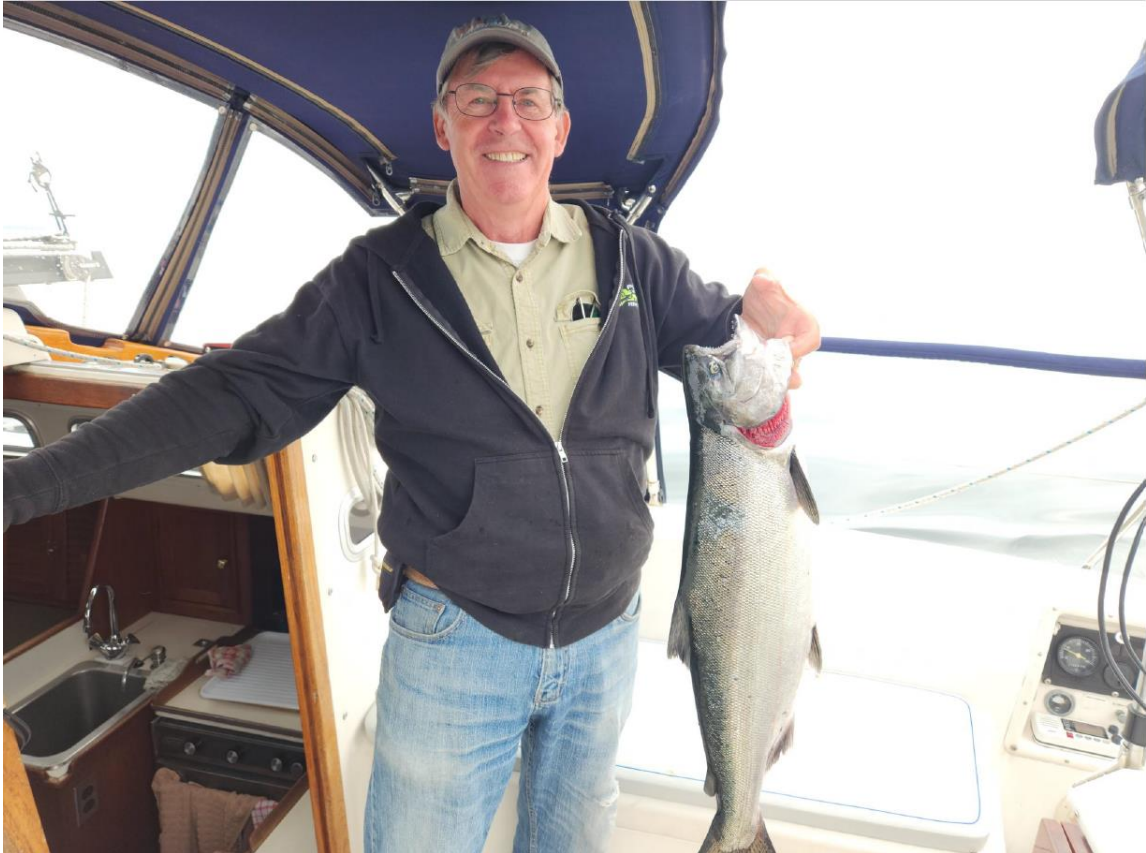
Chinook salmon that fed 3 persons for a 3 day sailing trip (with some to spare!)