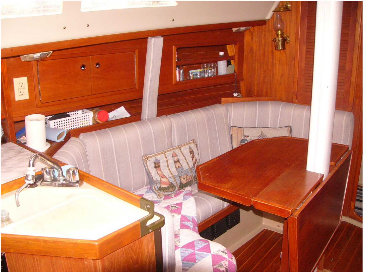
Cabin: port settee.