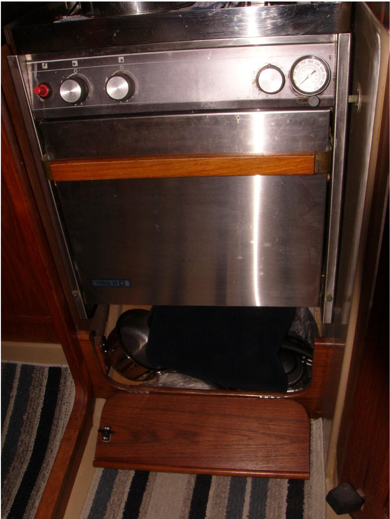
Upgraded pot and pan storage.