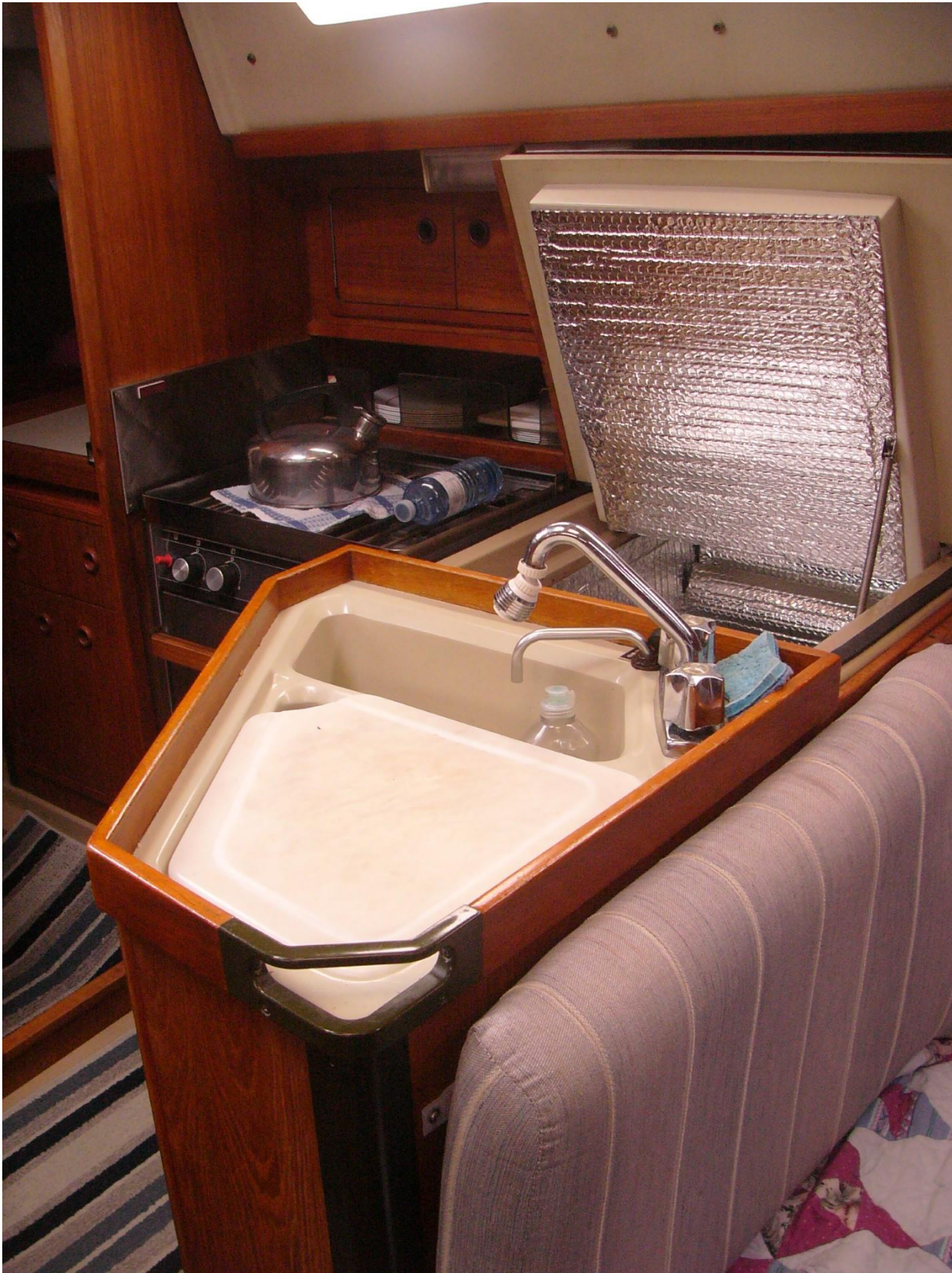
Upgraded ice box converted to new fridge/freezer.