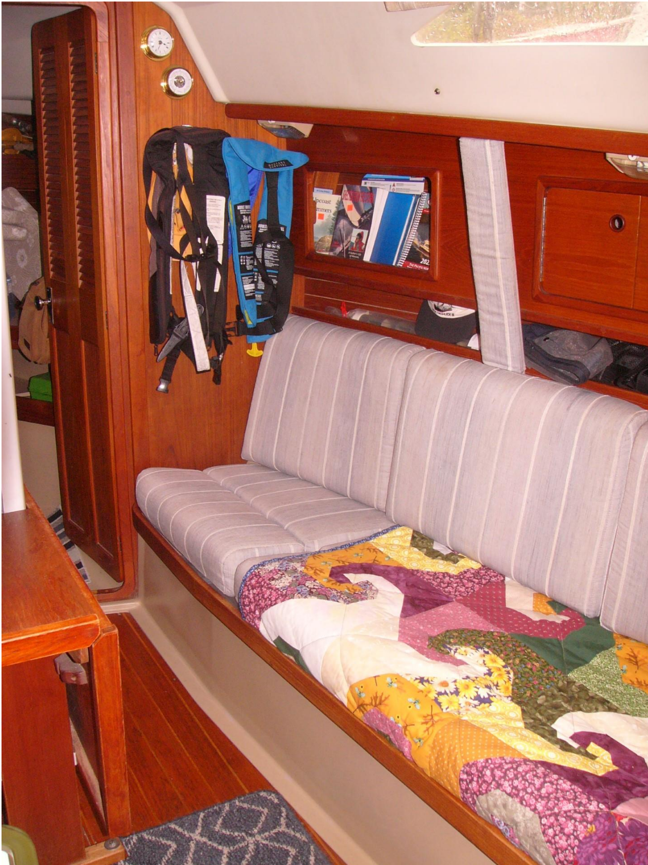
Cabin: Starboard settee.