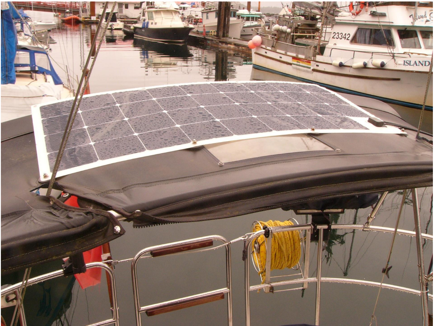
New flexible solar panel (115 w).