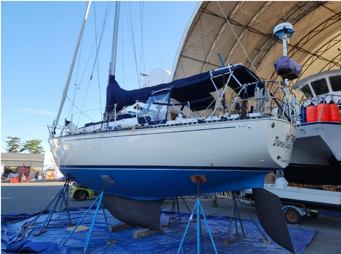
"Dance Lightly" with a new polish and paint, July 2023.